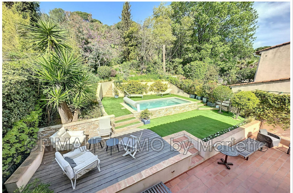
Villa 935 Grimaud

Document non contractuel 03/05/2024 - Prix T.T.C